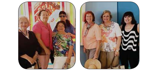
"Mamma Mia" Fun